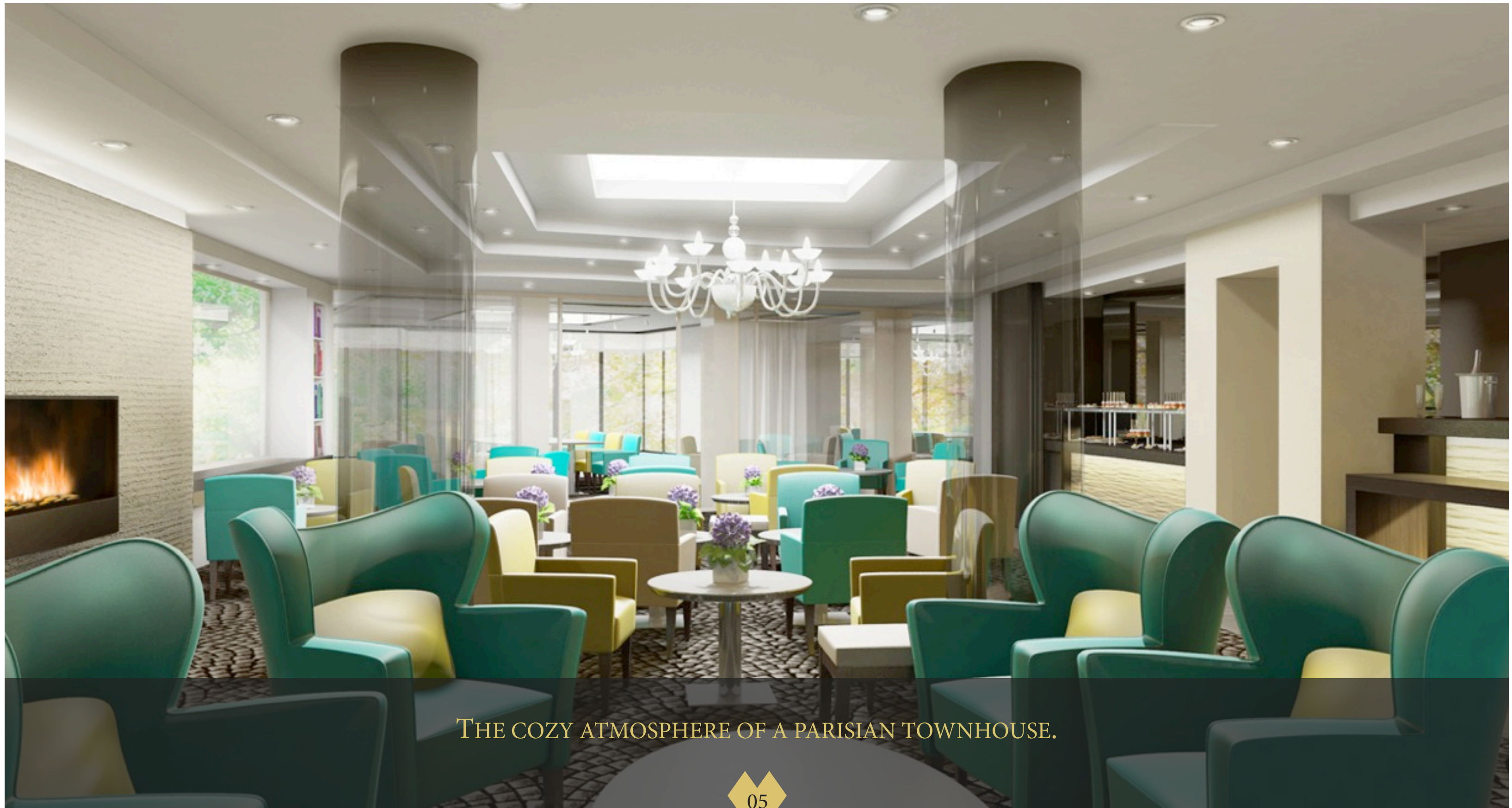
THE COZY ATMOSPHERE OF A PARISIAN TOWNHOUSE.